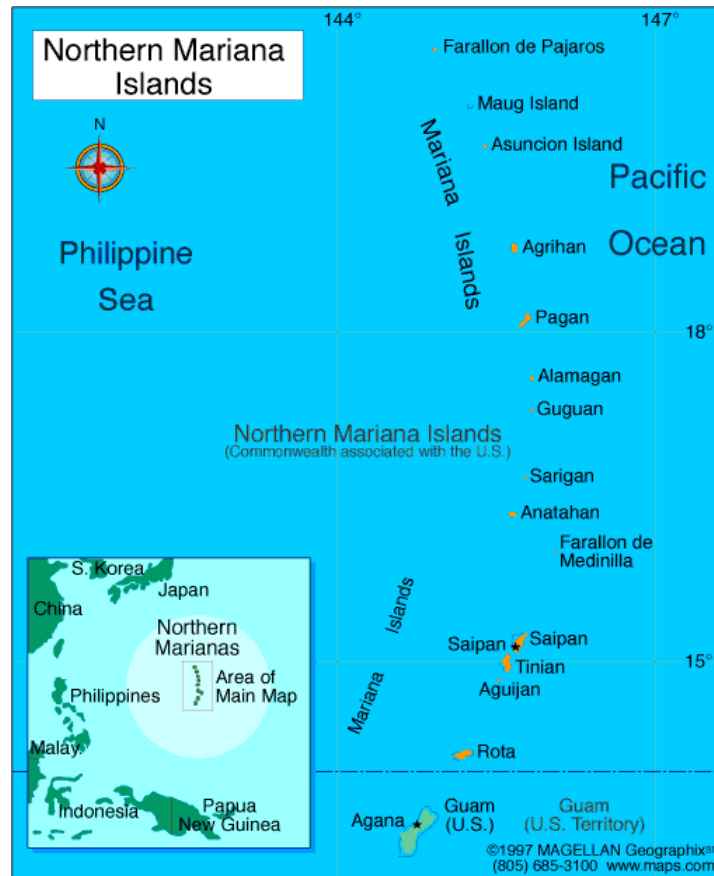
Figure 1. The Northern Mariana Islands.

family group retention, and territoriality of Golden White-eyes, mist nets had to be moved regularly after catching two to four birds in a given area; an approach that was also taken in 2011.