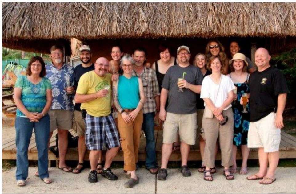
The 2012 MAC/AZA crew on-site and working diligently.